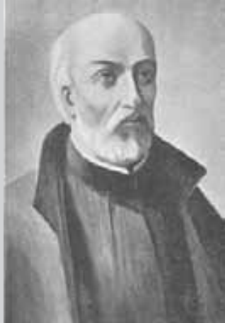
St. John de Brebeuf